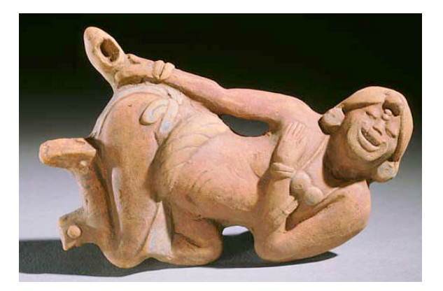
Guatemala Escuintla Maya culture, Escuintla, Middle-Late Classic periods, A.D. 400-850

In the New World another system of administering a honey based drug was used particularly by the Maya. Archeologists excavating Mayan tombs turned up tubes (of rubber?) whose function was unclear. Paintings found on a number of vases illustrate in detail the use of these tubes. One illustration shows a recumbent figure with his legs spread. He is receiving an enema which is being administered by a person (woman?) standing beside him holding a container connected to a tube. There is also another male ladling enema fluid out of a large jar. Another painting of this kind shows an attractive young woman (goddess?) removing the clothing from a to a male (god?). In front of her are the enema container and what looks like a rubber enema bulb syringe. Besides paintings there is even statuary with the same theme.